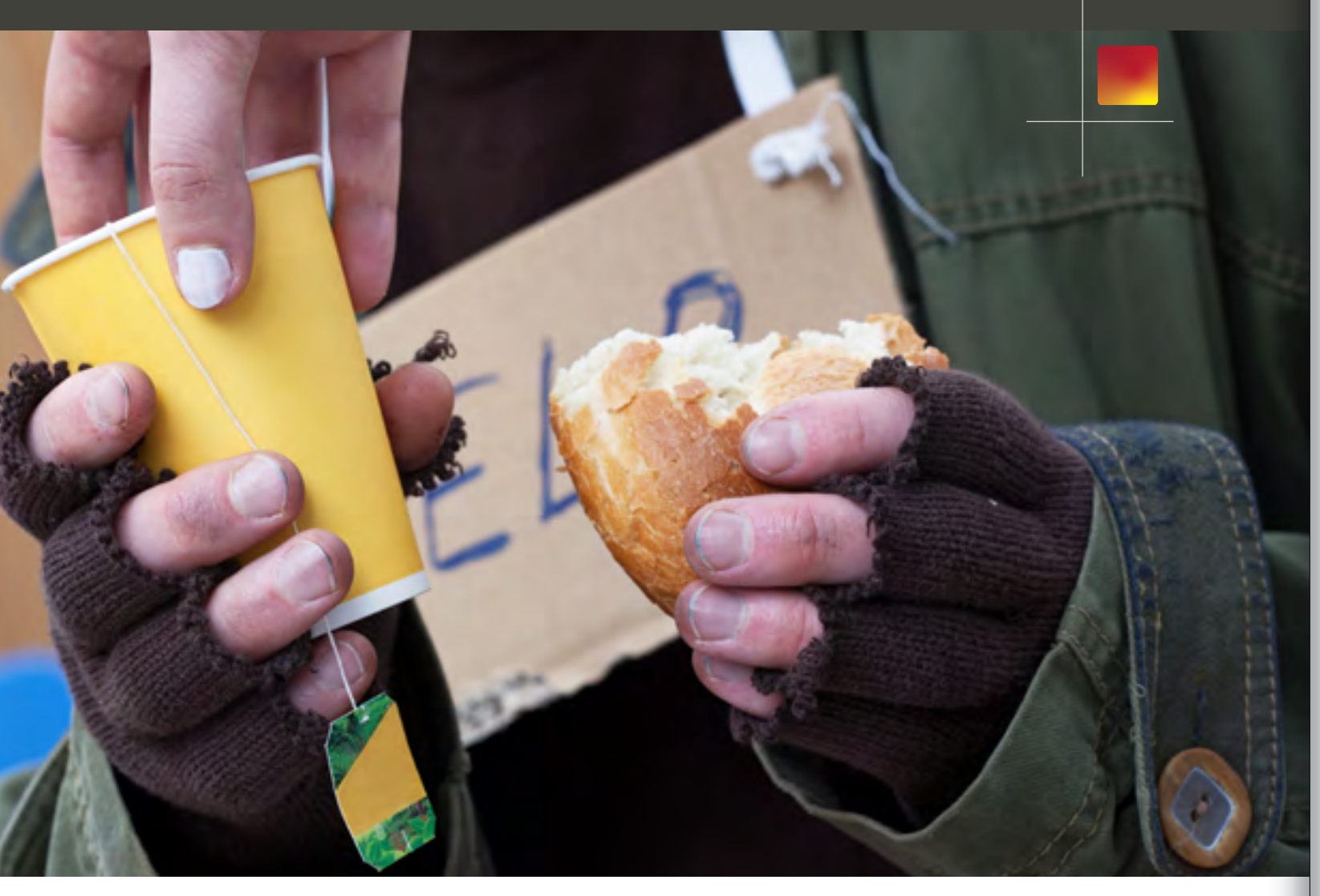
Page 38 | Practice Guide for Local Government

However, workers should always operate with the discretion that if collecting this consent is judged likely to be a barrier to engagement, workers can decide when they bring up the matter of consent.