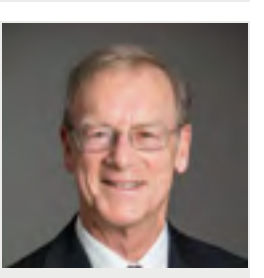
City of Monash Mayor Cr Brian Little