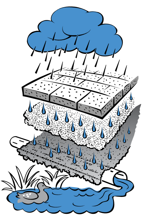
Porous paving will allow for drainage in urban areas.

Porous paving is installed in the same way as traditional paving and is available in many forms. They can be used to replace asphalt, concrete or other impervious pavers.