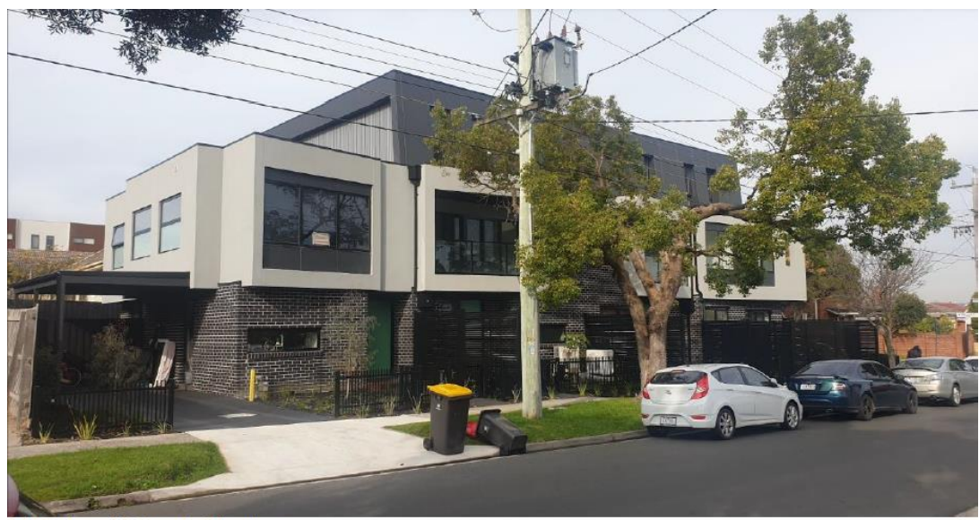
31 Colonel Street, Clayton.

46 Four three storey attached dwellings in Madeleine Road at 31 Colonel Street which terminate eastward views from this western leg of Colonel Street are shown below (extracted from the applicant's photographs).