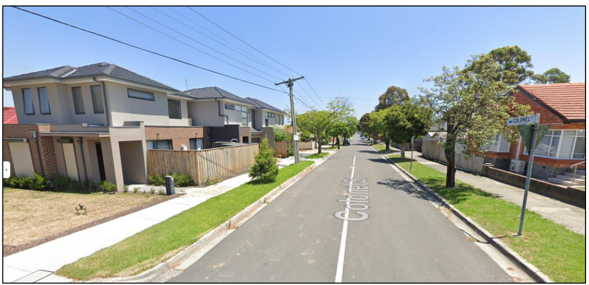
Source: Google street view – Image captured January 2019 showing 75A, 75B and 75C Madeleine Road on the left.

double storey dwellings at 21-23 Colonel Street and the three double storey dwellings at 36 Thompson Street (to the rear).