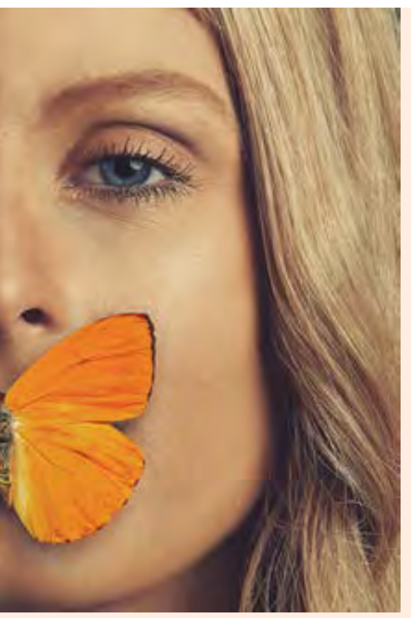
Asif Hussein Infectious 2021 from the series The lost year pigment ink-jet print