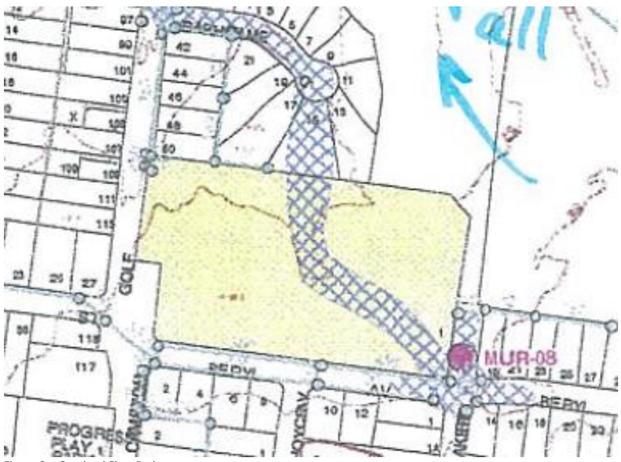
Figure 2 – Overland Flow Paths