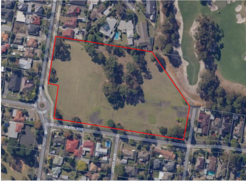
Figure 1 – Site Location Plan