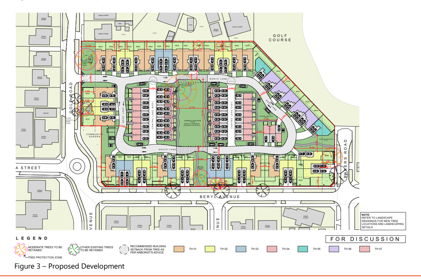
Figure 3 shows the proposed development.

The site at 52 Golf Road, Oakleigh South is to be developed for a residential development. The total number of dwellings is expected to be 86 with a combination of 2, 3 and 4 bedroom townhouses. For the purpose of any planning permit applications made, this report will focus solely on the stormwater management strategy and management of the proposed development. A summary of the site is shown in Table 1.