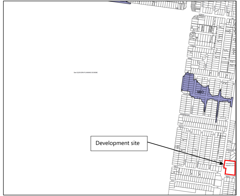
Figure 2 shows the planning overlay relative to the proposed site

Reference to the City of Monash Council Planning Overlay mapping indicates that the development site is not subject to any Special Building Overlays (SBO) or Land Subject to Inundation (LSIO). This indicates that the site should not be prone to storm water overflow that would result in a 1 in 100 year storm. Appropriate measures should still be put in place to ensure the development does not flood in storm events.