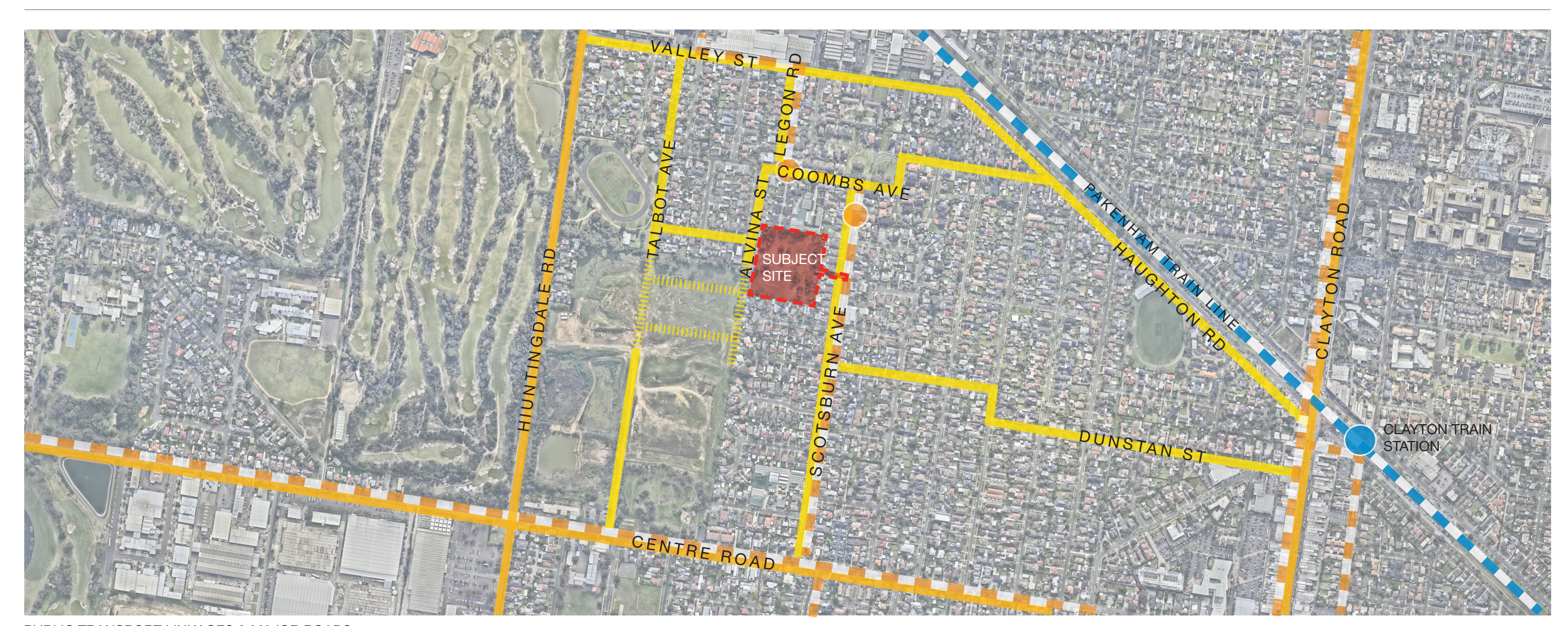
PUBLIC TRANSPORT LINKAGES & MAJOR ROADS