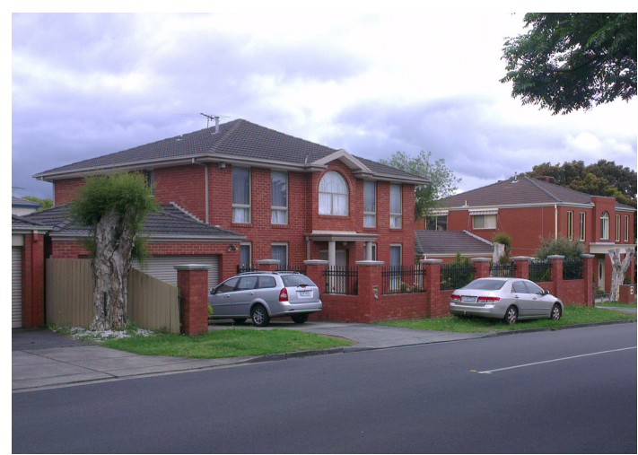
2. DOUBLE STOREY BRICK HOUSE