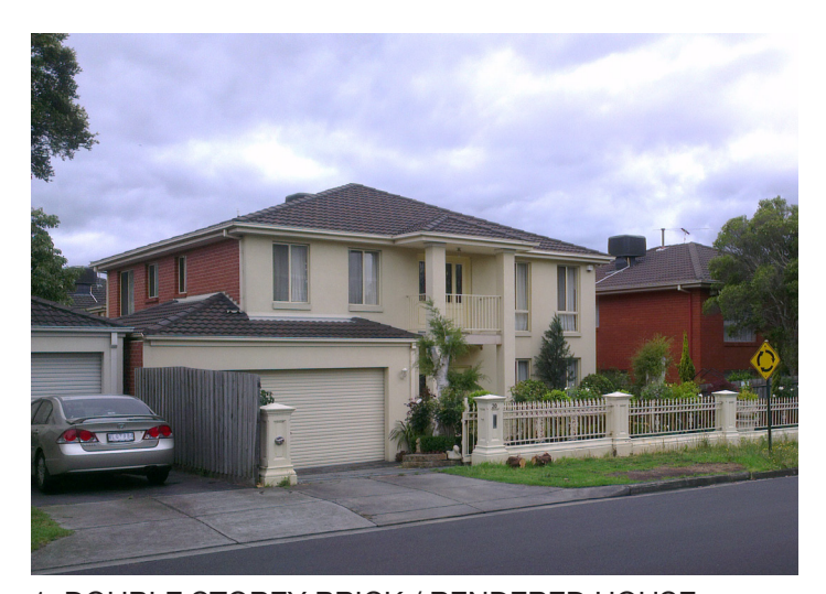
1. DOUBLE STOREY BRICK / RENDERED HOUSE