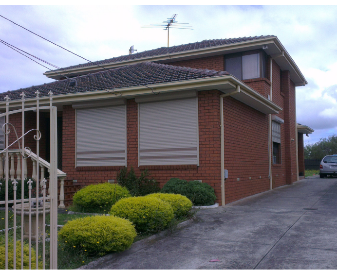
6. DOUBLE STOREY BRICK HOUSE