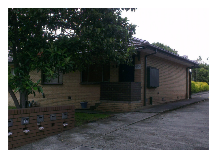
3. SINGLE STOREY BRICK UNITS