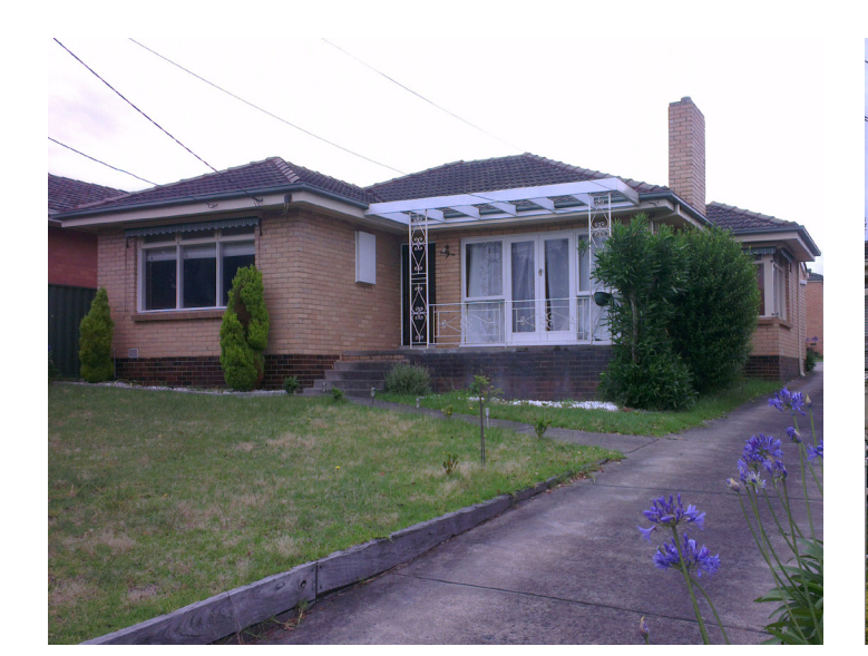
5. SINGLE STOREY BRICK HOUSE