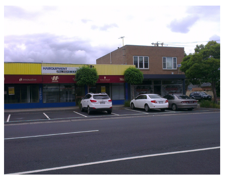
7. SHOPS NEARBY TO SITE - SCOTSBURN AVE