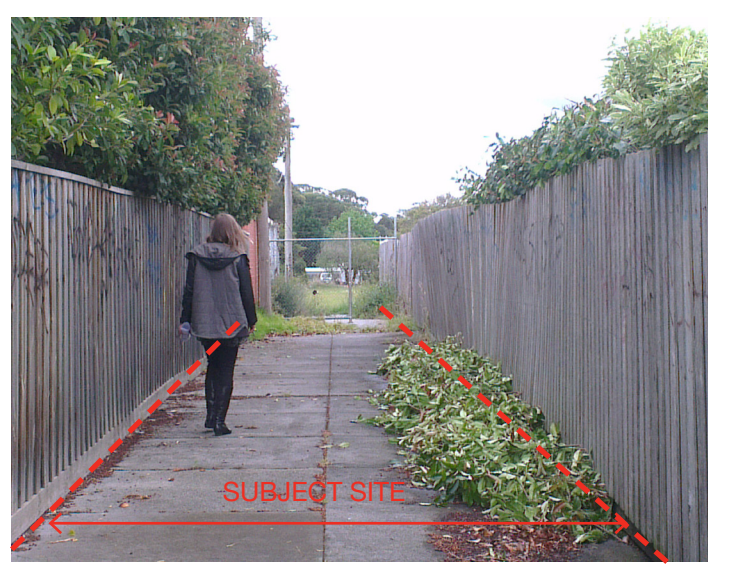
6. VIEW TOWARDS SITE FROM PEDESTRIAN PATHWAY