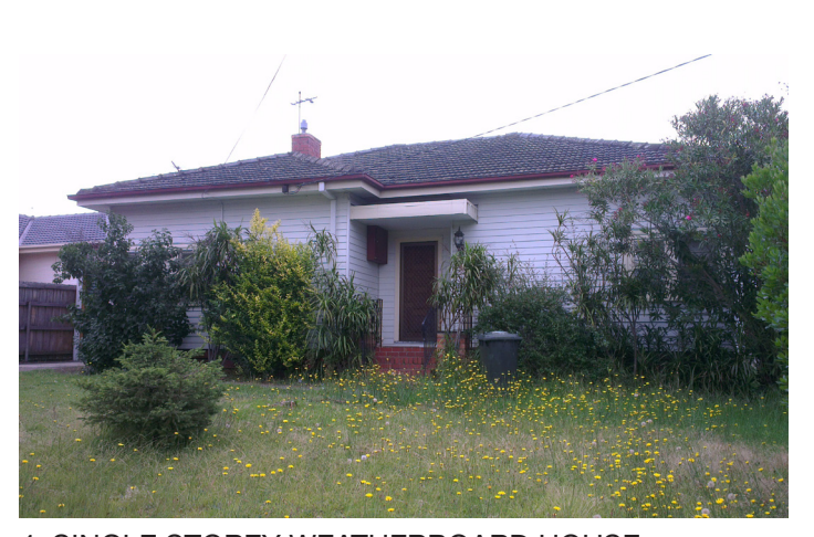
4. SINGLE STOREY WEATHERBOARD HOUSE