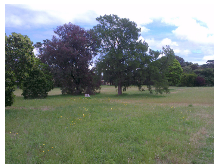
7. VIEW OF SUBJECT SITE