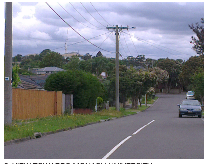
5. VIEW TOWARDS MONASH UNIVERSITY