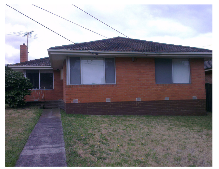
8. SINGLE STOREY BRICK HOUSE

Rothe Lowman Property Pty Ltd ACN 005 783 997