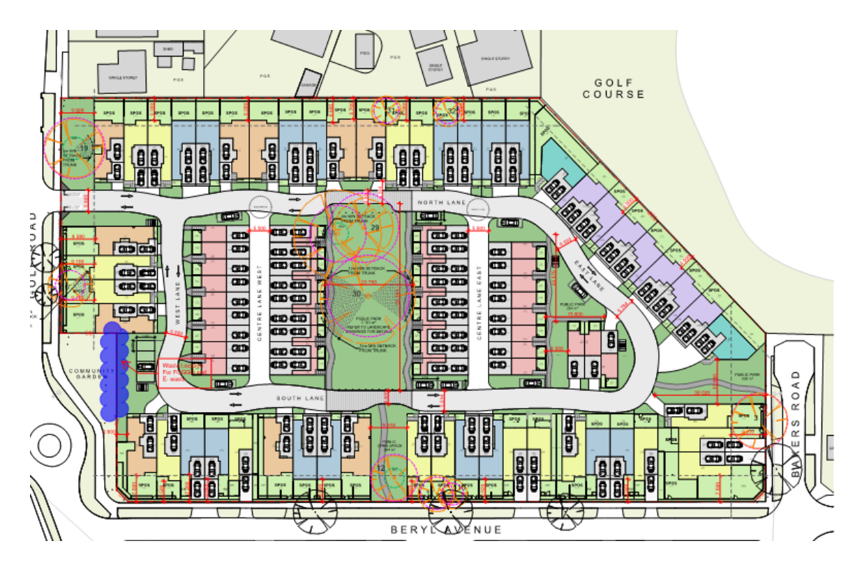
Image 7.1 –Location of communal FOGO composting and e-waste bin facilities