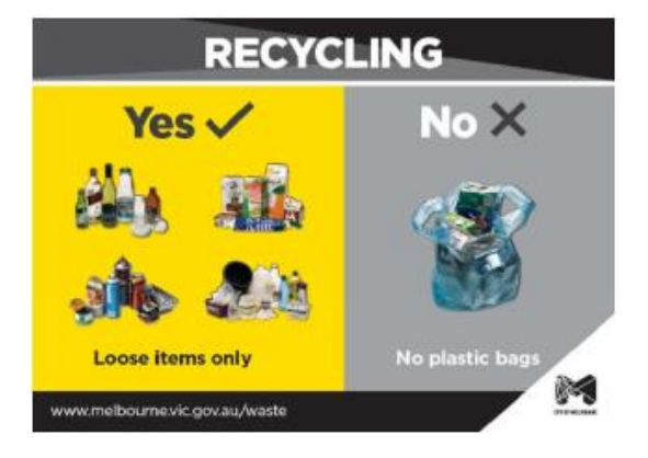
Image 7.2 –Example signage which can be provided to the Townhouse owner