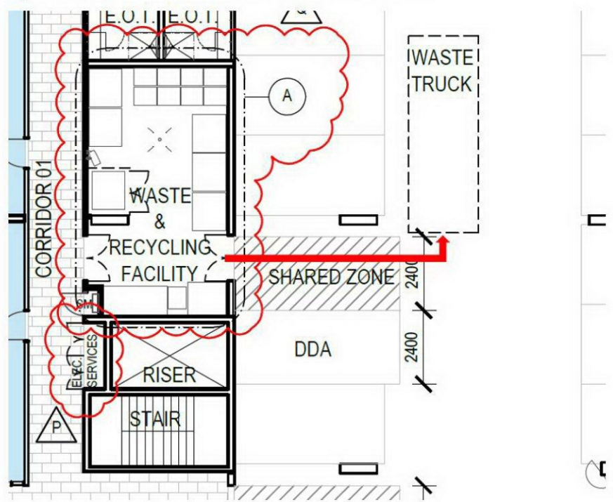
Figure 5.1: Bin Transfer Path and Waste Collection Point

The bin transfer path and collection point are shown in Figure 5.1 below.