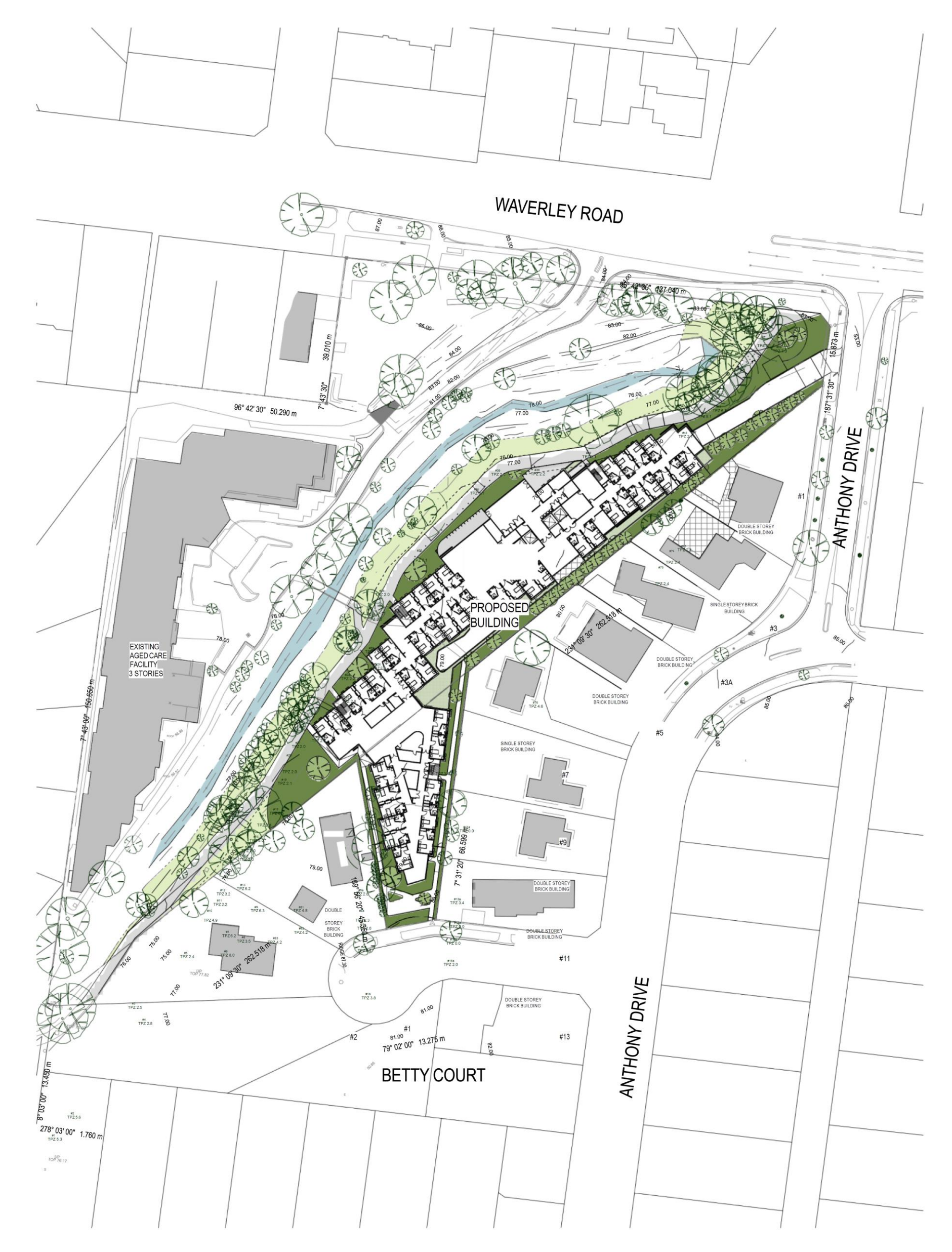
{\bf Figure~1: Proposed~activity~anticipated~under~the~approved~CHMP~14454.}