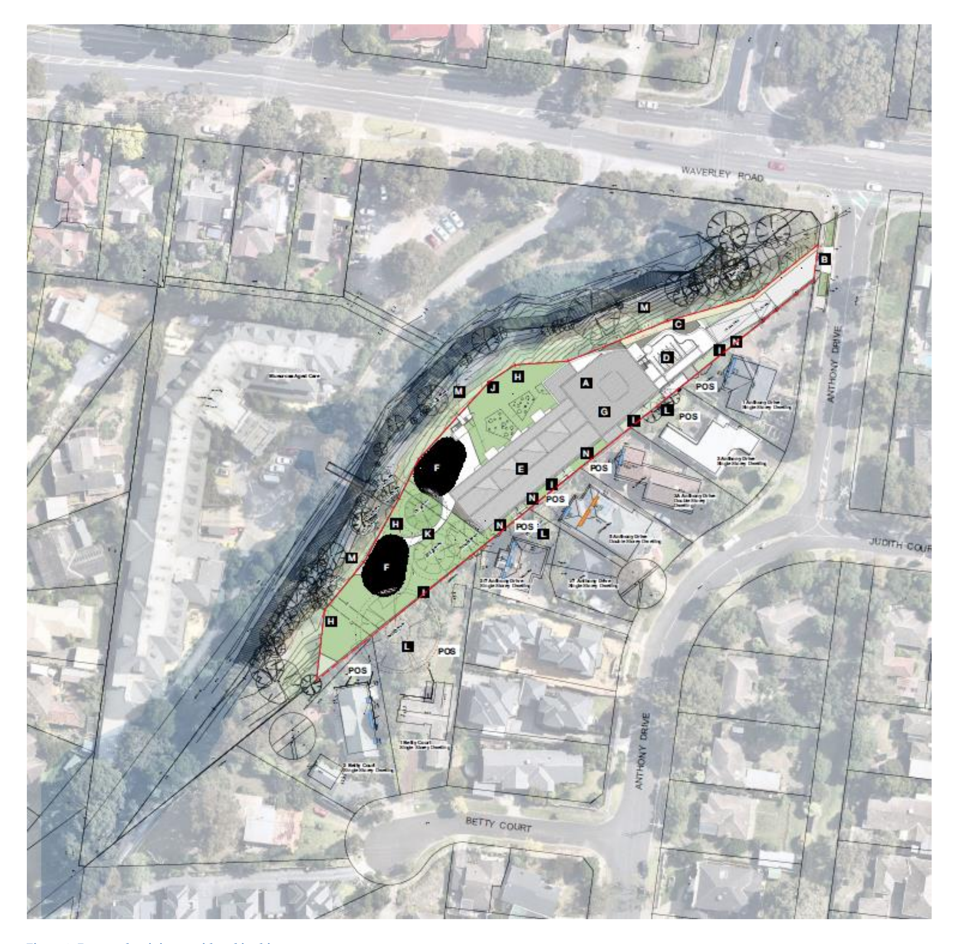
Figure 2: Proposed activity considered in this assessment.