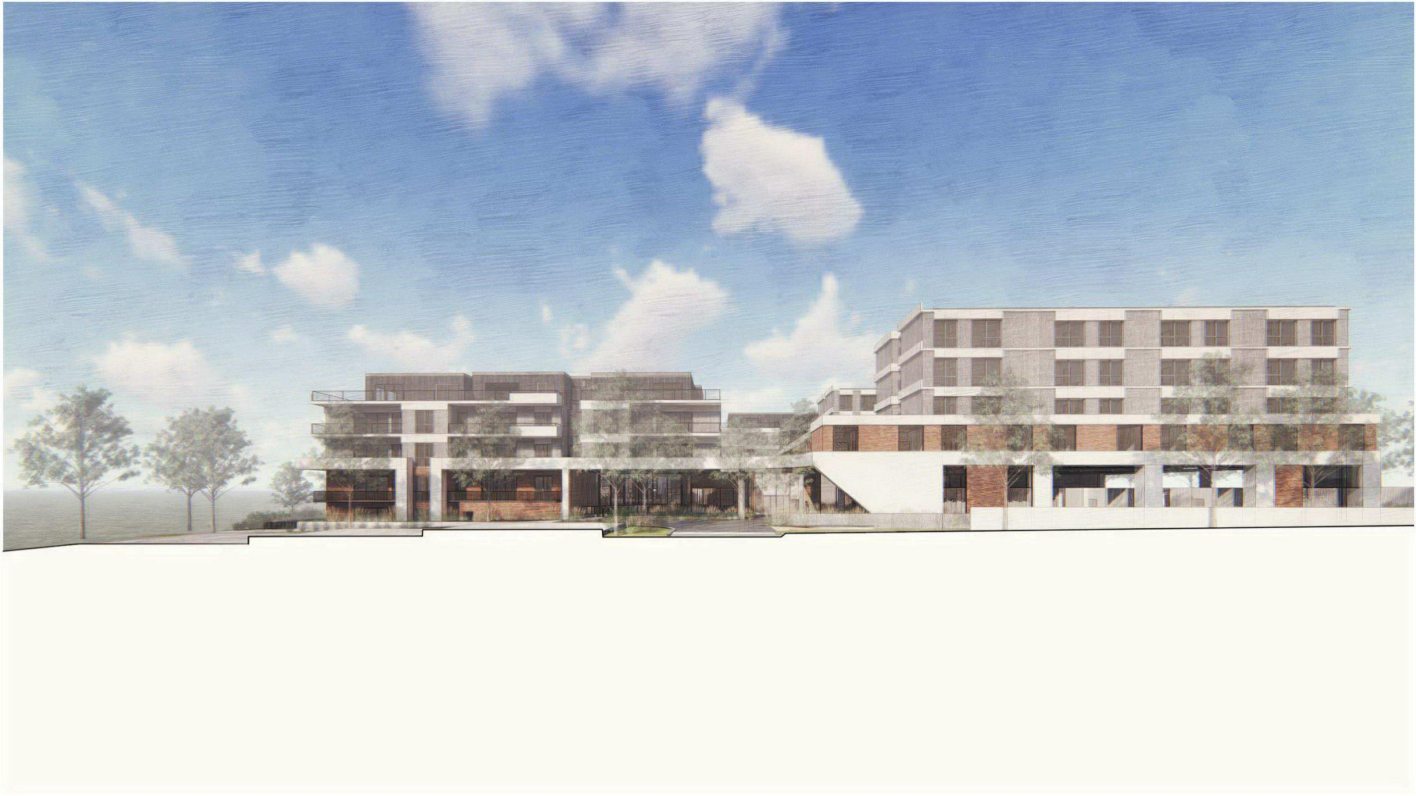
MAIN BUILDING EAST ELEVATION VIEW