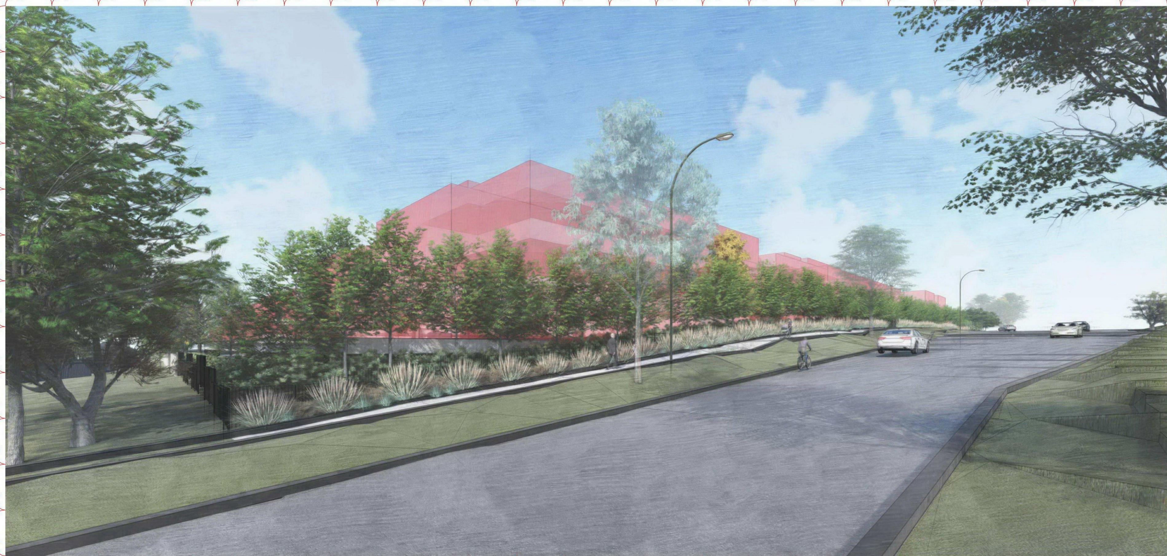
JACKSON RD NORTH VIEW PREVIOUSLY APPROVED MASSING VIEW