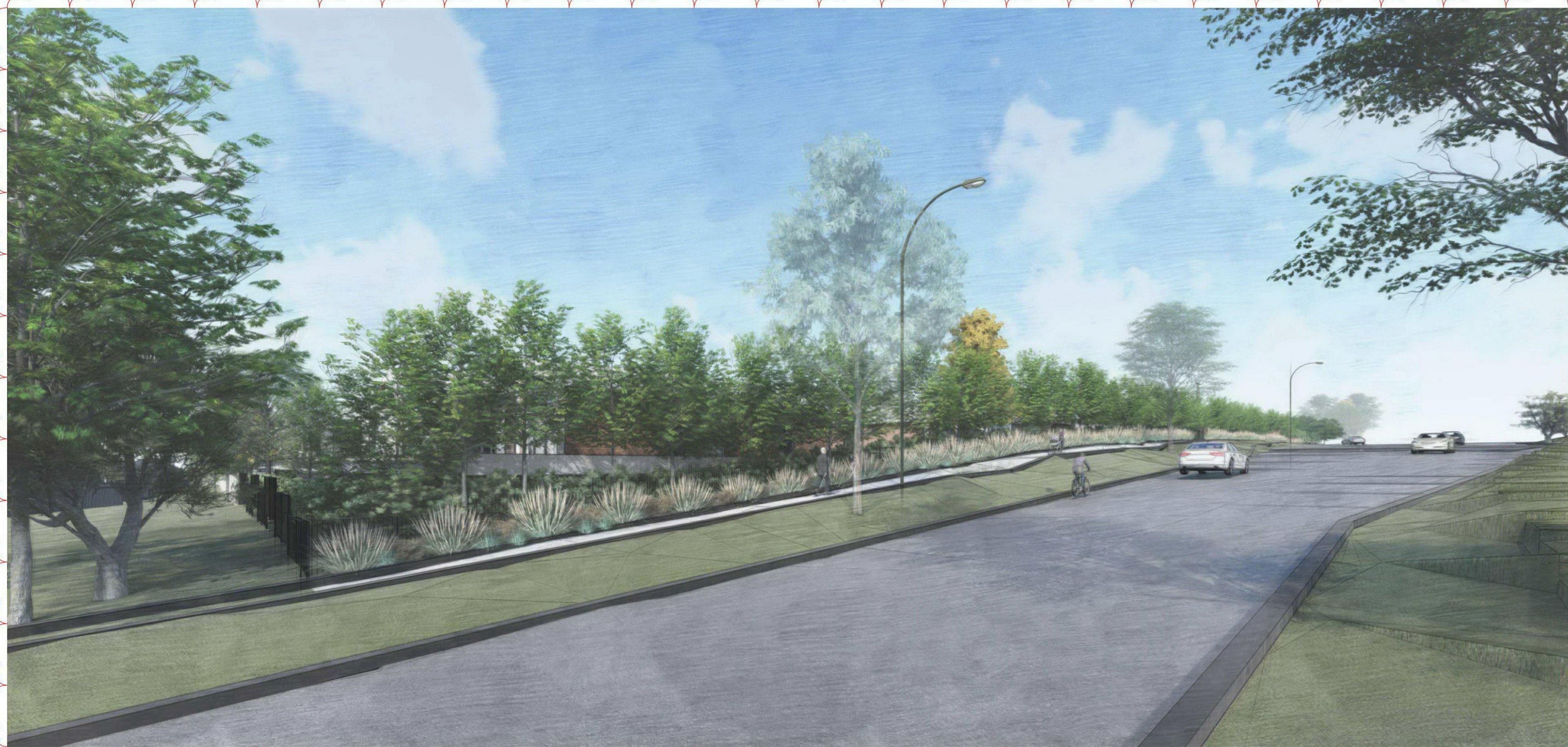
JACKSON RD NORTH VIEW PROPOSED MASSING VIEW