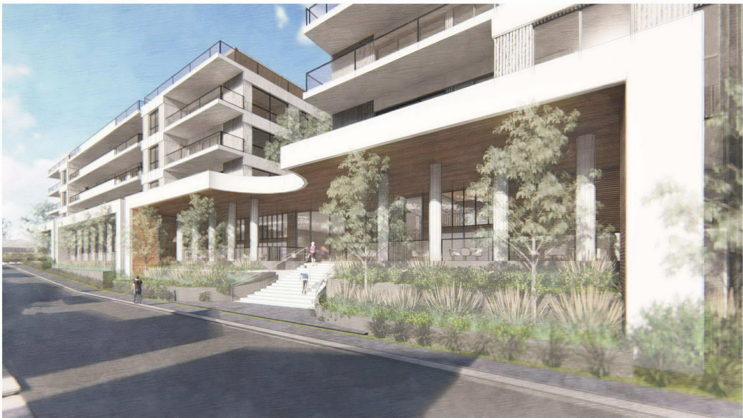
MAIN BUILDING WEST ENTRANCE AND LOUNGE