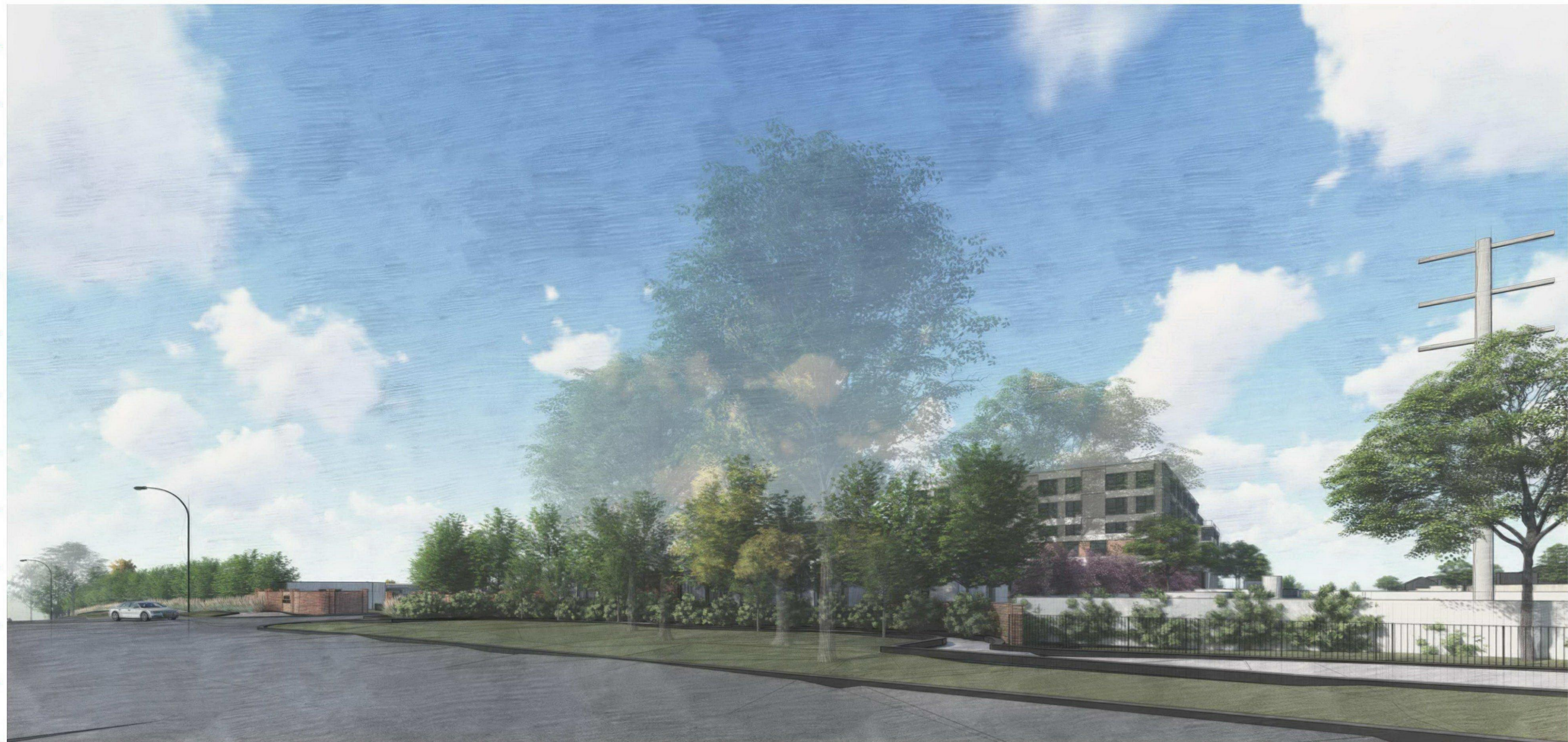
JACKSON RD SOUTH VIEW PROPOSED MASSING VIEW