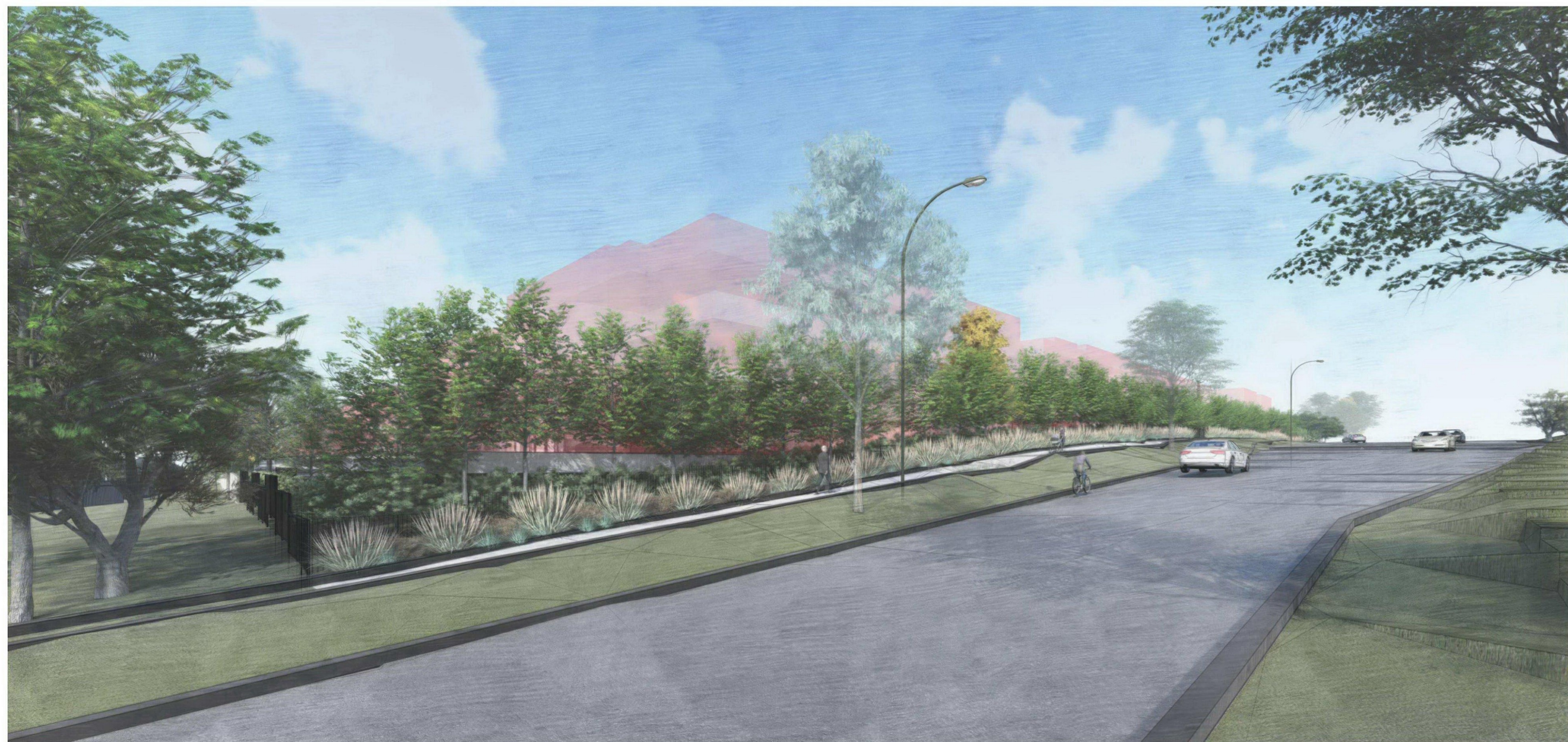
JACKSON RD NORTH VIEW COMPARISON MASSING VIEW