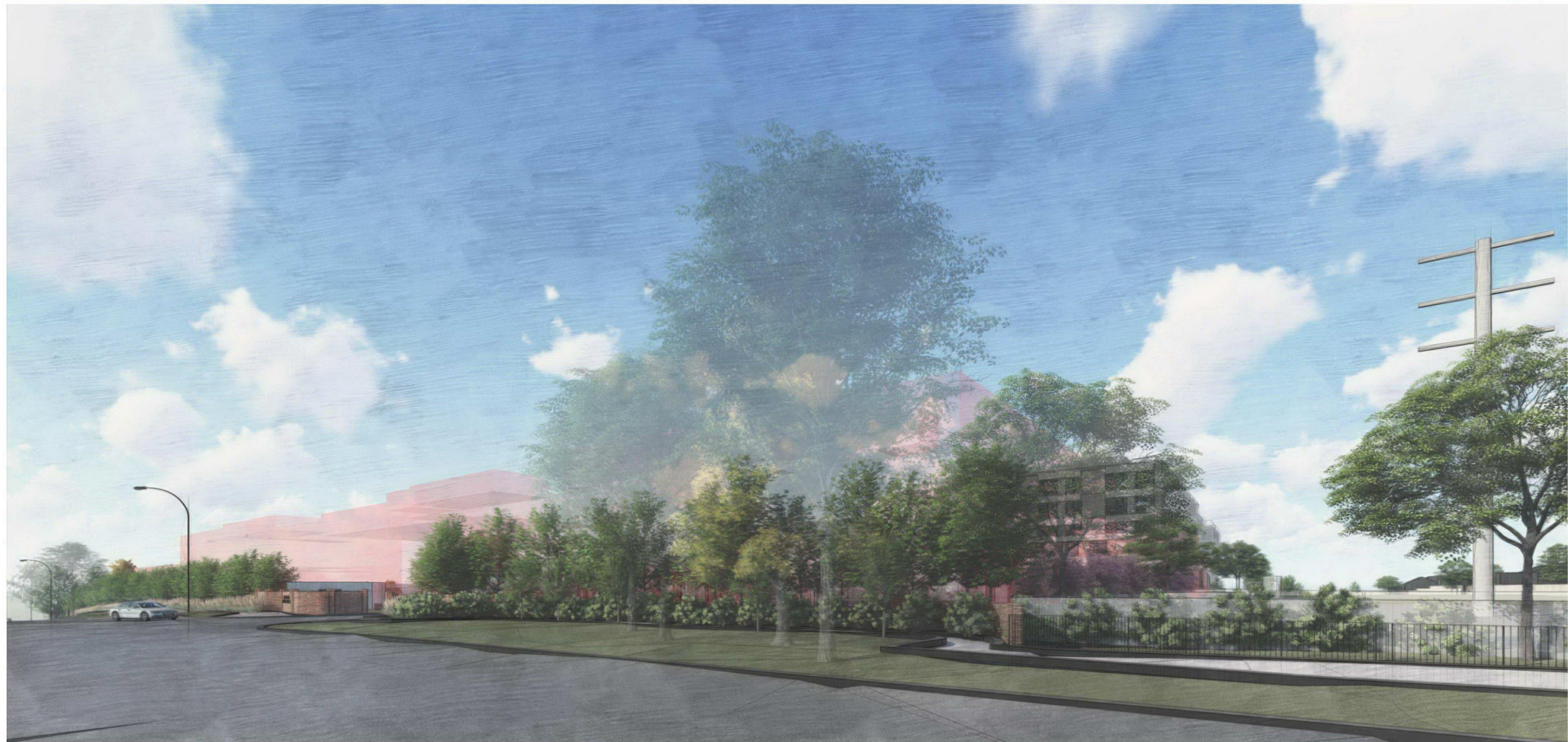
JACKSON RD SOUTH VIEW COMPARISON MASSING VIEW