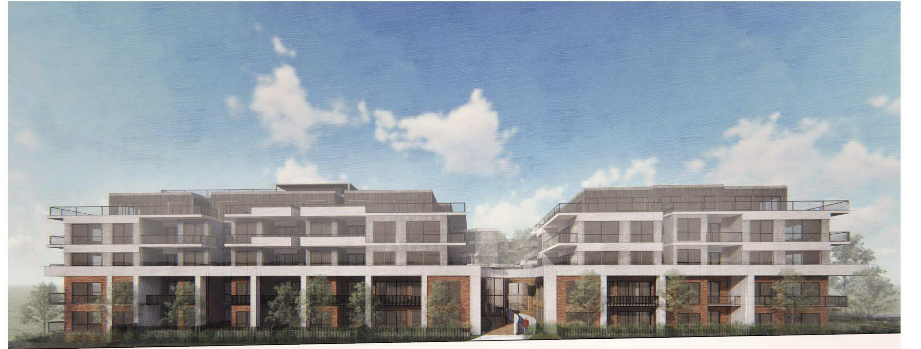
MAIN BUILDING NORTH ELEVATION VIEW