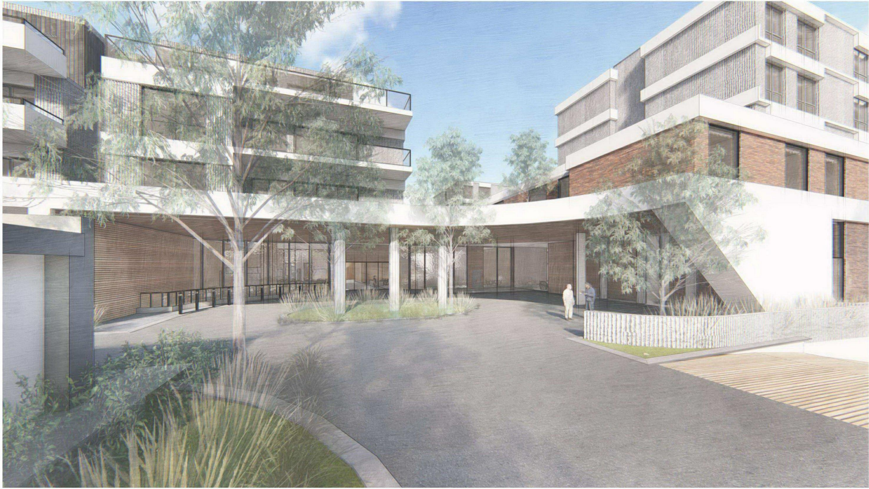
MAIN BUILDING EAST ENTRANCE AND PORTE COCHERE VIEW