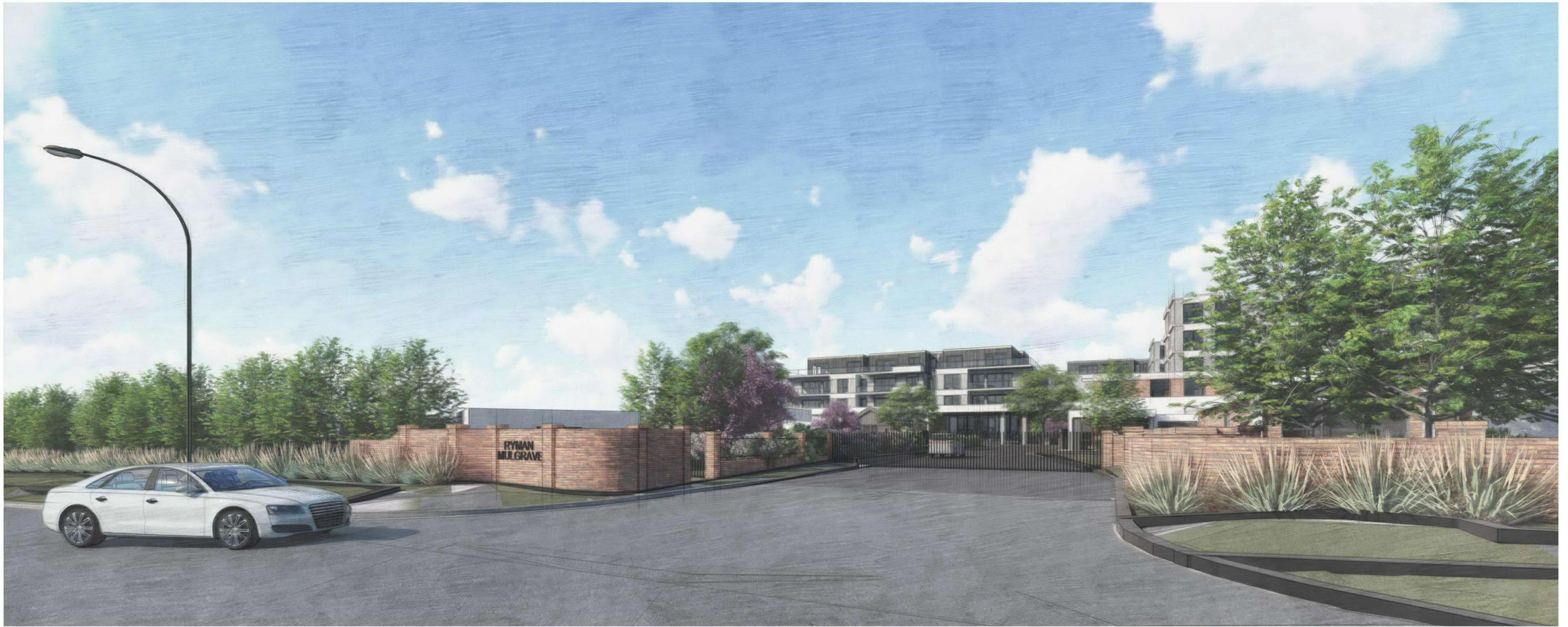
JACKSONS ROAD MAIN ENTRANCE VIEW