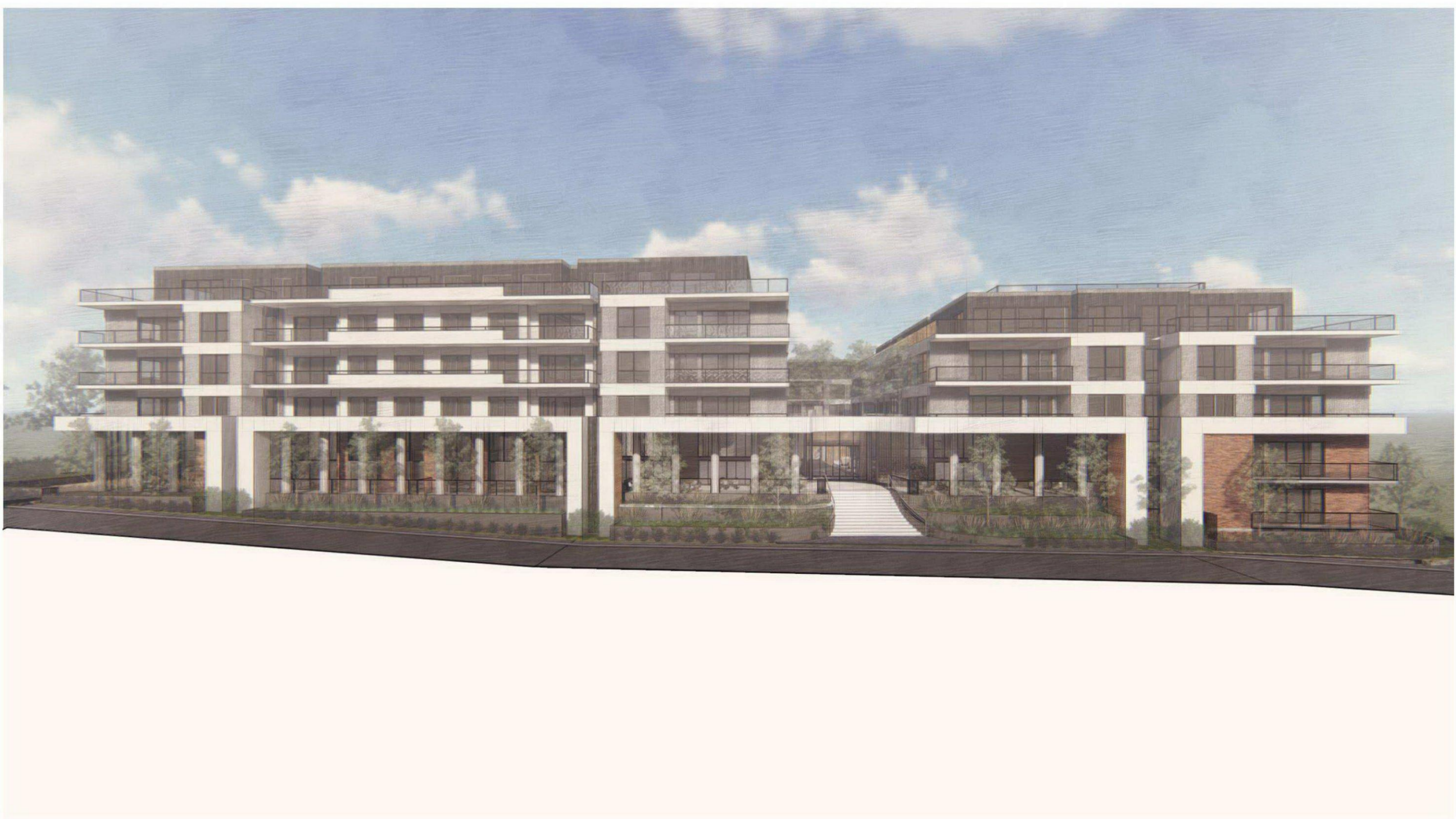
MAIN BUILDING WEST ELEVATION VIEW