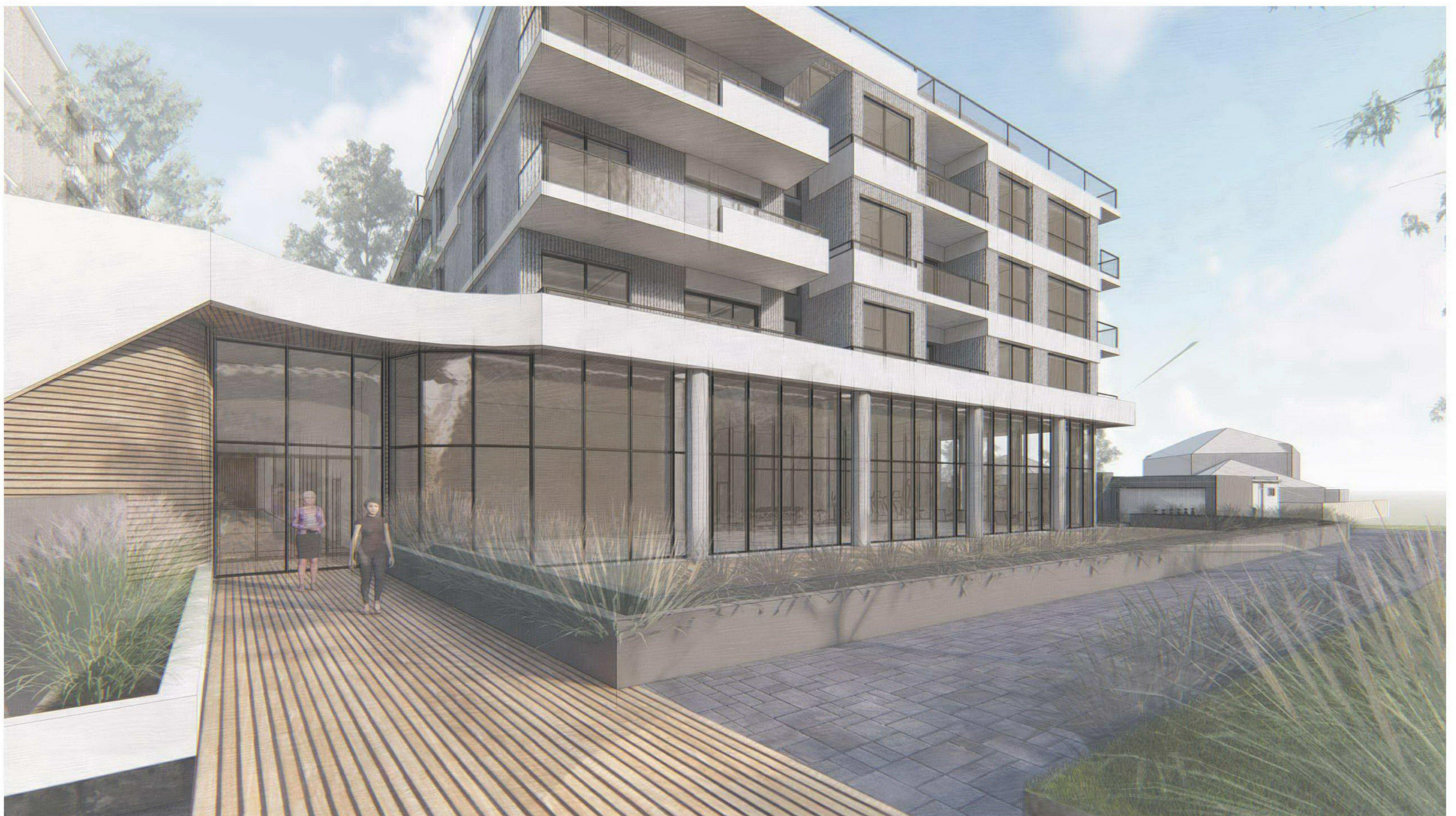
MAIN BUILDING WEST ENTRANCE