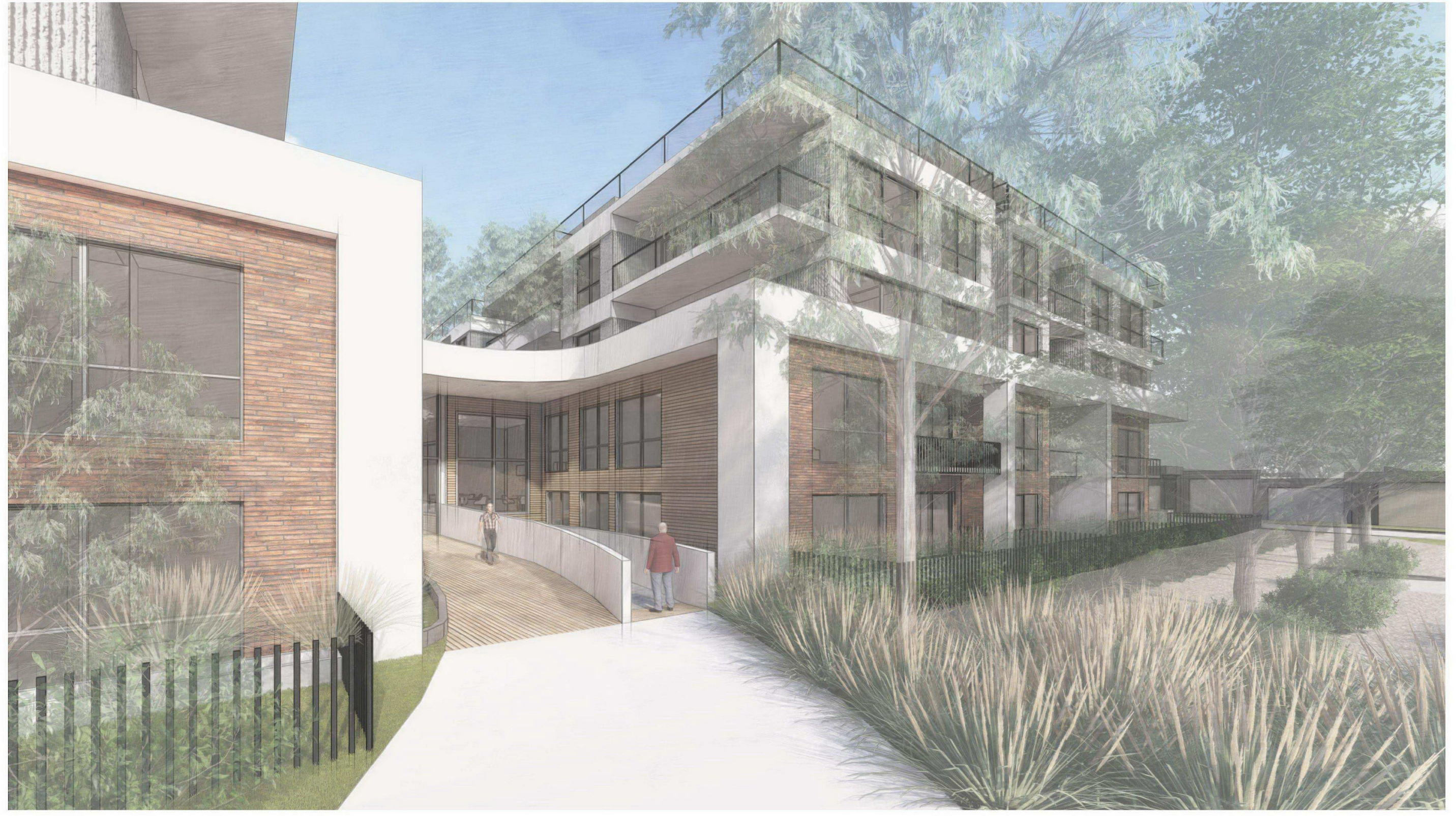
MAIN BUILDING NORTH ENTRANCE AND CENTRAL GARDEN VIEW