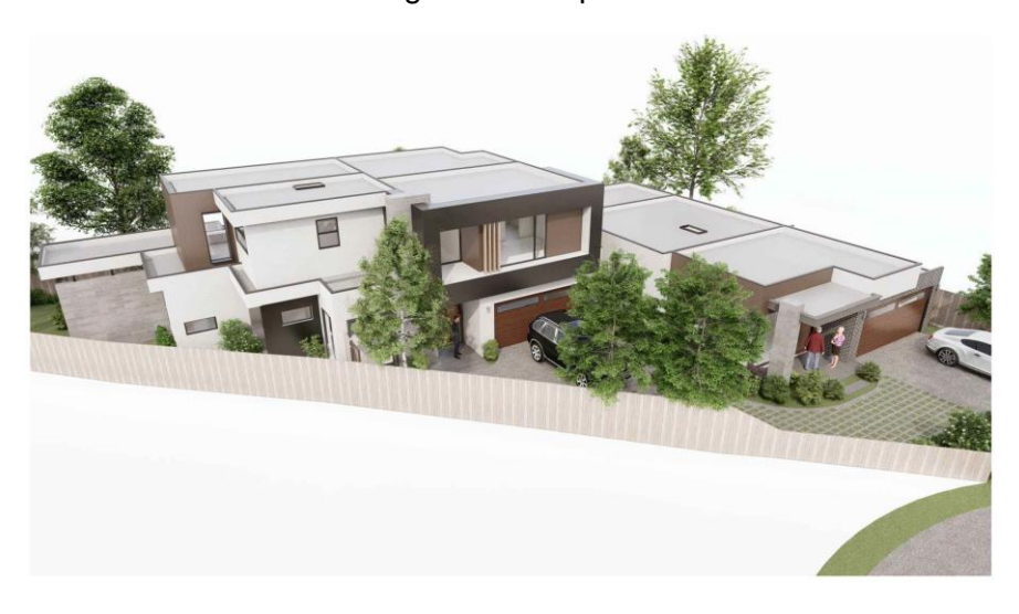
Figure 2: Aerial view from the north.