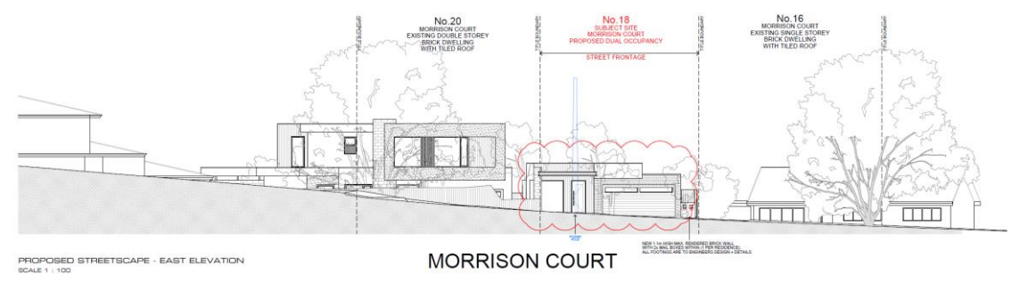
Figure 5: Streetscape elevation.