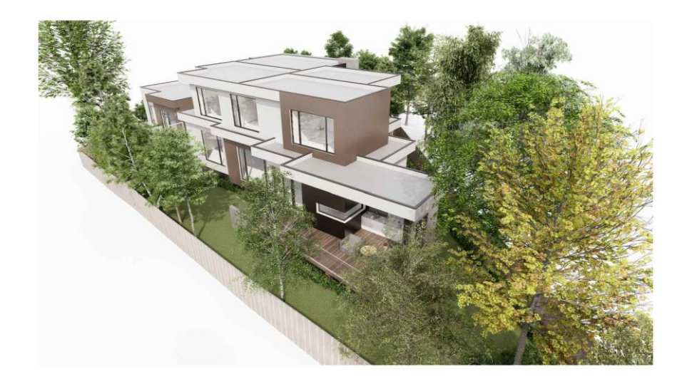
Figure 3: Aerial view from the east.