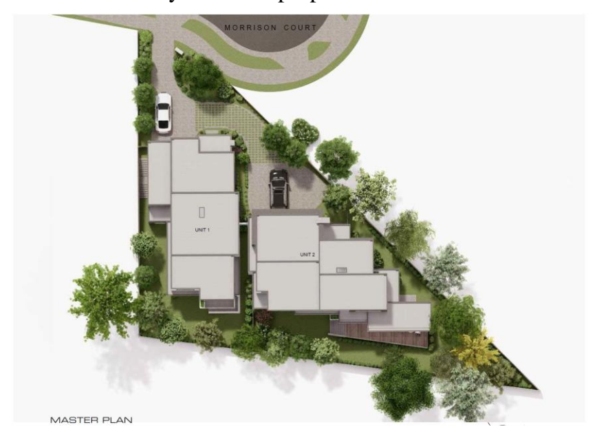
Figure 1: Site plan.

This is an application by Jia Jun Shen ( applicant ) to review the decision of Monash City Council ( Council ) to refuse permission in relation to permit application TPA/53753 on 16 September 2022 for the construction of two double storey dwellings and the removal of three (3) trees in a Vegetation Protection Overlay at 18 Morrison Court, Mount Waverley ( site ). Figures 1, 2 and 3 show the layout of the proposal.