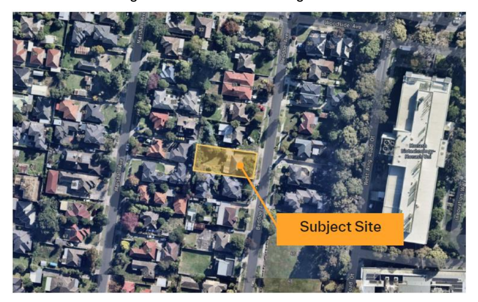
Figure 1: Site & surrounding context<sup>1</sup>

The site and its surrounding context are shown at Figure 1, below.