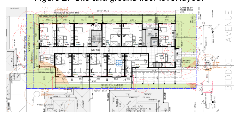
Figure 2: Site and ground floor level layout<sup>3</sup>

Source: Plans prepared by Jesse Ant Architects, Amendment D, dated 25 September 2023, plan TP06.