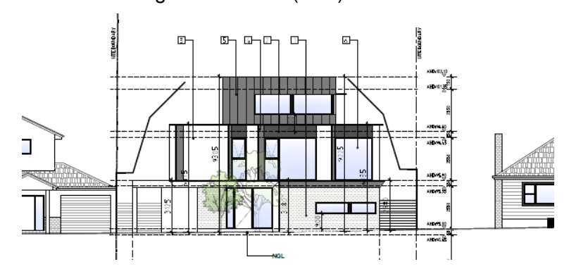
Figure 3: Street (east) elevation4