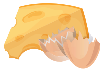
Cheese, dairy, eggshells