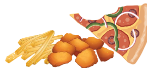
Fried foods, uneaten food