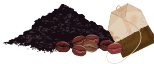
Coffee grounds, tea leaves, tea bags (no labels)