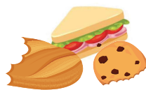
Bread, sandwiches, cakes, biscuits