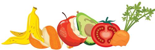
Fruit and vegetable peels, scraps