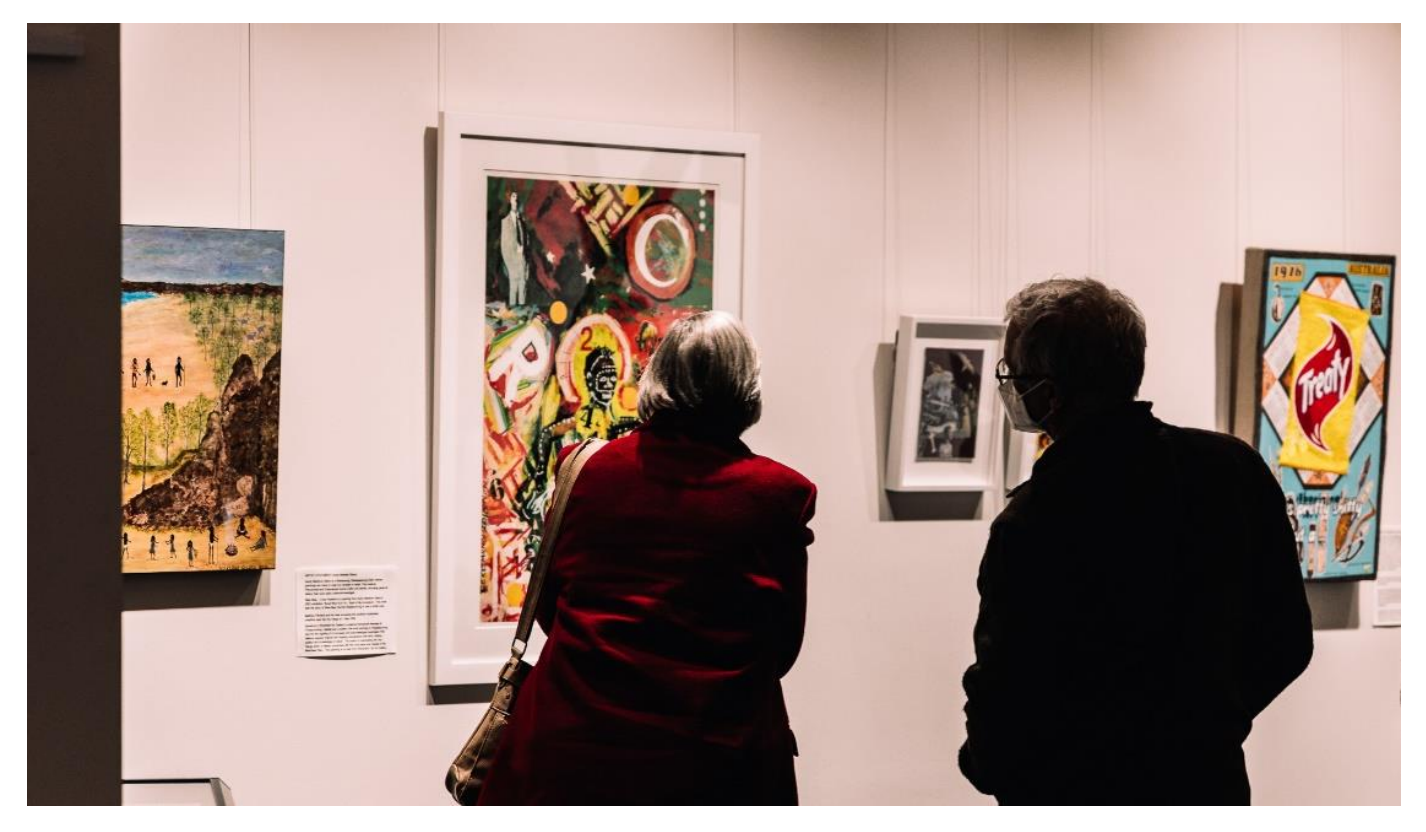
Image: TREATY Exhibition at The Track Gallery, NAIDOC Week July 2022