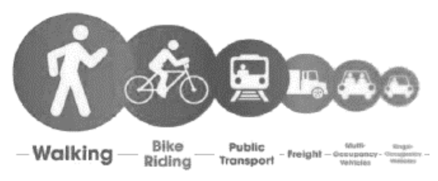
Transport Mode Priority