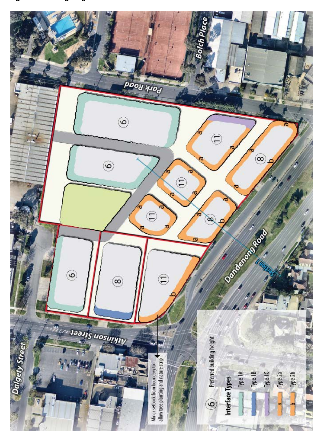
Figure 3: Building Heights