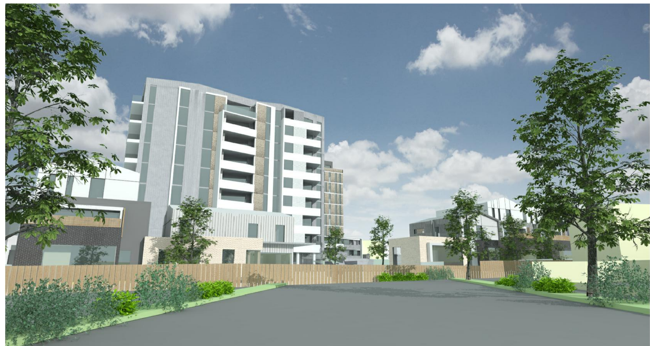
PERSPECTIVE VIEW - V01