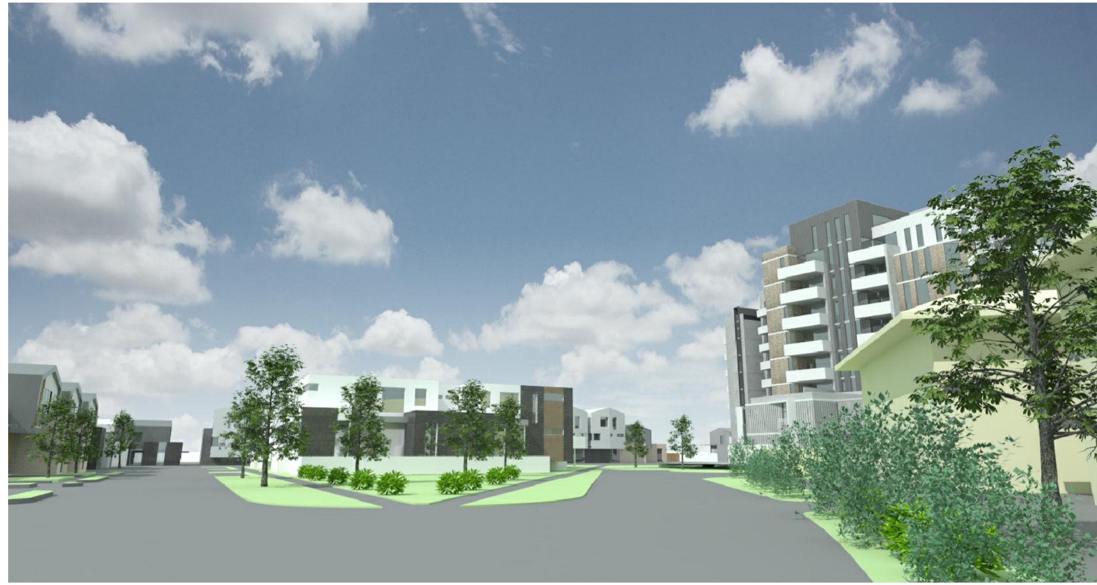
PERSPECTIVE VIEW - V03