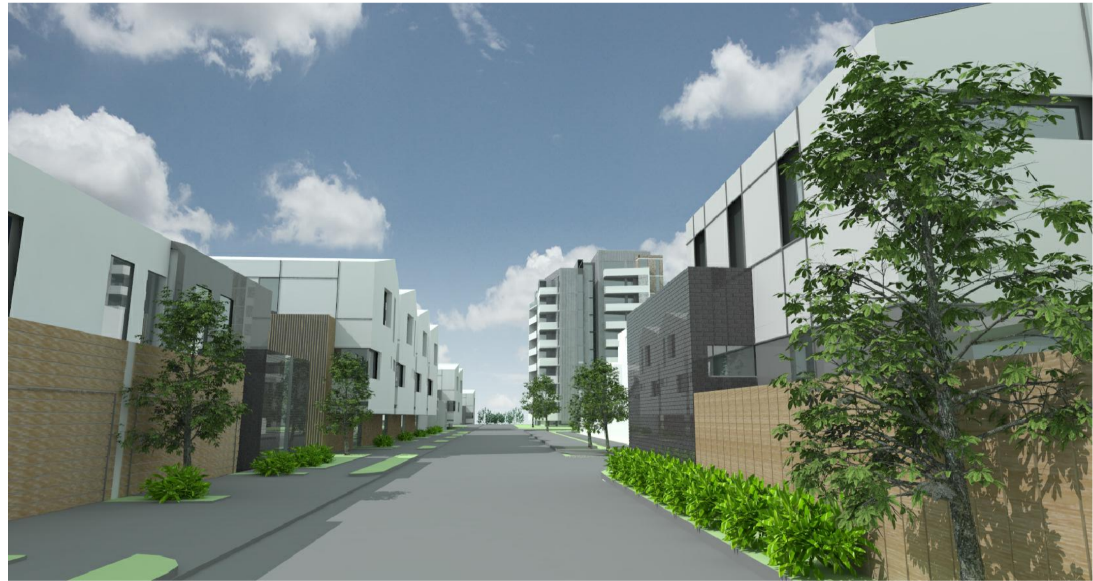
PERSPECTIVE VIEW - V02