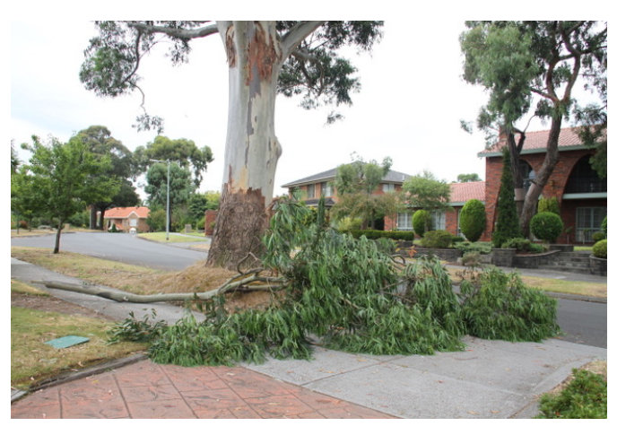
#Fallen branch from recent high wind event.

A root barrier has previously been installed on the footpath side to prevent further disruption to the path.