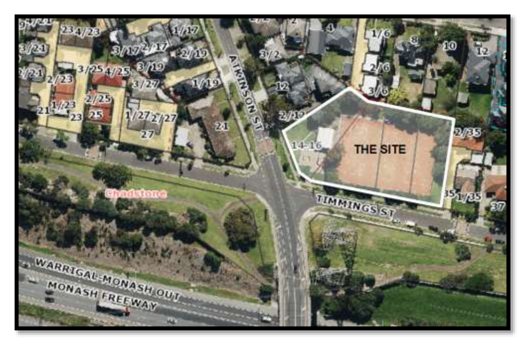
Plan of Subdivision 8883