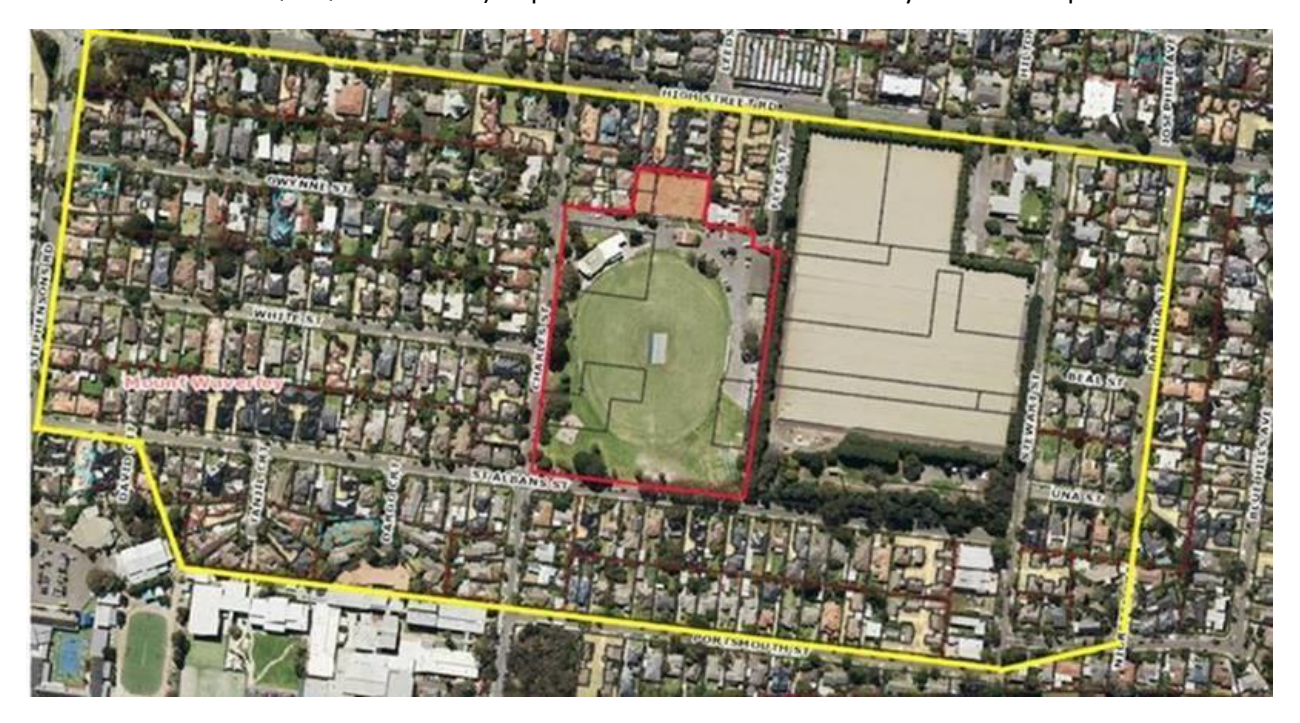
Flyer distribution area.

The flyer promoting the drop-in session was distributed to 344 residents via Bing postal services (Ref. ID: MG9HGKGHY46R44QTXQYGPY7T7X44) as per catchment zone within the yellow line depicted below: